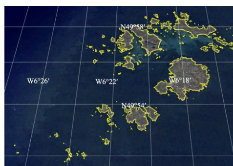
Figure 2 Map of the Isles of Scilly (.kmz format)

Received: 10-10-2019; Accepted: 03-11-2019; Published: 24-12-2019