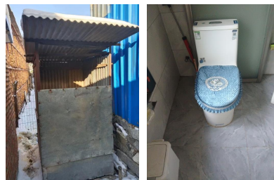
Figure 8 Comparison before and after rural toilet renovation in Lanjia Village (2020,2023)

Taking advantage of GIES-related development opportunities, core villages such as Lanjia Village advanced rural construction projects, including road surfacing, sewage treatment, landscaping, and village beautification. New rural roads and cultural facilities were constructed, and a citywide campaign for rural household toilet upgrading was implemented. Between 2020 and 2025, more than 7,000 households completed toilet retrofits, significantly improving local living and production conditions (Figure 8).