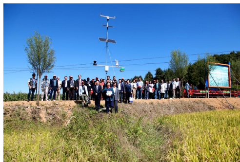
Figure 9 FAO representatives visited the GIES ground station system of the Lanjia Village Rice case (September 2024)

geographical-indication products increased steadily. Supported by technology-driven upgrading and brand development, the output values of the core GIES categories, such as rice, fruit, fish, and corylus, rose steadily from 2022 onward. By 2025, the output value of rice had reached 500 million CNY, fruit 400 million CNY, fish 300 million CNY, and large corylus 300 million CNY. The economic gains of all major categories improved significantly, while certified products such as Qiantang Fish, Chinese Cherry Apple, and Large Corylus obtained clear brand premiums and sold at higher prices after certification, further strengthening brand value [6,14] . Second, both