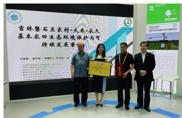
Figure 3 Plaque-awarding ceremony for the Lanjia Village Rice case at the 2021 CIFTIS, Beijing, September 2021. Former FAO Deputy Director-General HE Changchui and CAS Academician TONG Qingxi presented the plaque, which was received by WANG Pingping, then Mayor of Panshi City