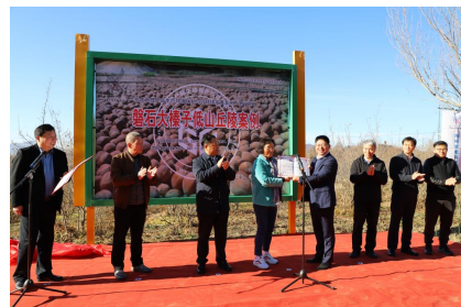
Figure 6 Unveiling ceremony for the Panshi Large Corylus case (October 2022)

system from a local pilot centered on Lanjia Village to citywide promotion, thereby establishing a new pattern of large-scale, standardized, and brand-oriented development [14,15] . The case was unveiled in July 2022 (Figure 7). By adopting a model of "Qiantang Association + cooperatives + farmers", the case has integrated industrial resources and promoted the upgrading of the rice industry from single-stage cultivation to value addition across the entire value chain, thereby enhancing regional agricultural quality and efficiency and supporting rural revitalization.