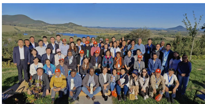
Figure 12 Group photograph after FAO officials visited Beiguokui Village, Baoshan Township, Panshi, Jilin Province (September 2024)