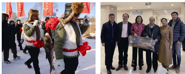
Figure 5 Winter fishing cultural festival and the GIES New Year Fair

The Panshi Qiantang Fish summer angling and winter fishing case built on Panshi’s abundant pond-and-reservoir resources and focuses on ecological aquaculture and the preservation of fishing culture. Its major products include high-quality bighead carp, common carp, crucian carp, and bluntnout bream [6] . Panshi has 2,410 reservoirs and ponds larger than 248 m 2 , and the water quality meets China’s Class I surface-water standard. Building on the fishing culture of the Songhua River Basin, the case has developed distinctive activities such as recreational summer angling and winter fishing festivals. Since its official unveiling in July 2022, it has continued to host annual winter-fishing cultural events and has participated in the GIES New Year Fair every year (Figure 5).