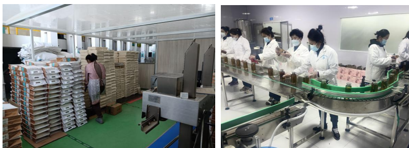
Figure 10 Production lines for Panshi rice and Chinese Cherry Apple products