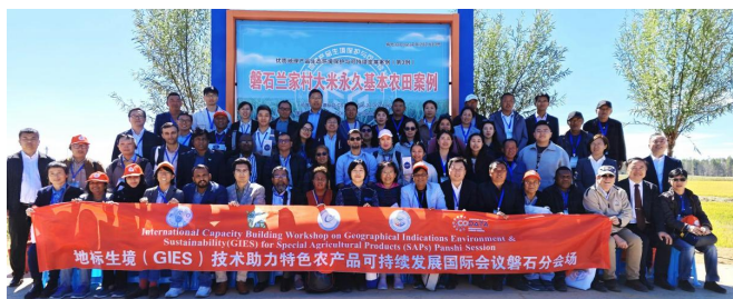
Figure 11 FAO officials visiting Lanjia Village, Niuxin Town, Panshi, Jilin Province (September 2024)

for comparable regions worldwide. Panshi has continuously promoted the exchange and dissemination of GIES practices through exhibitions, seminars, and related activities. Between 2020 and 2025, the city participated in 19 exhibitions and organized 29 related seminars. Through platforms such as the International Science and Technology Conference on Green Development, the CIFTIS, and the GIES New Year Fair, it expanded the visibility of both its brands and its development model. In 2024, the Food and Agriculture Organization of the United Nations (FAO) held a parallel session in Panshi on the use of GIES-related technologies to support the sustainable development of specialty agricultural products (Figures 11,12). Participants spoke highly of Panshi's practical experience, particularly its effective coordination among government support, scientific application, and farmer participation. The case was subsequently included in the FAO Asia-Pacific OCOF knowledge-sharing platform as a "good practice" for wider dissemination [21,22] . In 2025, the "Panshi Qiantang" product series was exhibited at the first FAO Global Exhibition of Specialty Agricultural Products in Rome, Italy, marking an important step toward international visibility and market outreach. The case therefore offers a practical example from China for advancing the FAO's Four Betters goals and the broader global agenda of agricultural sustainability and rural transformation.