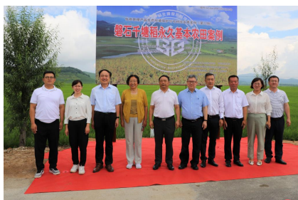
Figure 7 Unveiling ceremony for the Panshi Qiantang Rice case (July 2022)