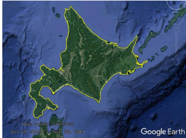
Figure 2 Map of Hokkaido Island (.kmz format)

Hokkaido Island dataset is part of “Global multiple scale shorelines dataset based on Google Earth images (2015)” [5] . The dataset of Hokkaido Island was developed based on the Google Earth satellite images in 2015 and related maps. The dataset is archived in .kmz and .shp [6] formats, consists of 17 data files with data size of 6.53 MB (compressed to 4.36 MB in two files).