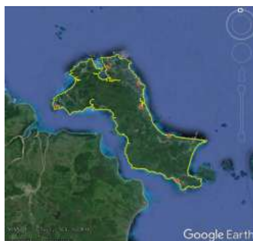
Figure 2 Map of Pulau Bangka (.kmz format)

Bangka Penang is the capital and largest town of Bangka Island. The second-largest city