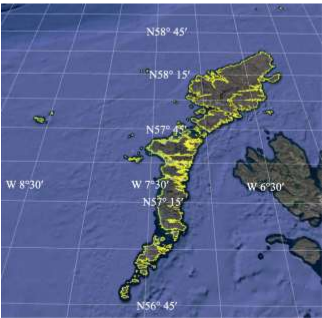
Figure 2 Map of the Outer Hebrides (.kmz format)

Outer Hebrides mainly consists of Lewis and Harris, North Uist, South Uist, Benbecula and Barra-Vatersay [7] . There are 2,413 islands and islets with area bigger than 25 m 2 in the Outer Hebrides. Lewis and Harris with area of 2,169.36 km 2 and coastline of 934.16 km is the largest and most northerly of the Outer Hebrides islands, lying 39 km from the west coast of the Scottish mainland and separated from it by the Minch channel. The North Uist is joined by constructed causeways with the Baleshare island in the northeast and with the Berneray island in the south. The Benbecula is similarly connected with the Eileann Chearabhaigh island in the north and the Flodaigh island in the south. Other larger islands include Great Bernera, Grimsay-Ronay, Taransay, Scarp, Pabbay, Isle of Scalpay, Eriskay, Hirta, Mingulay, Sandray, Wiay, Vallay, Ceann Ear, Boreray, Seaforth, Pabbay, Fuday, Barra Head, Ensay, Kirkbost, Killegray, Ceann Iar, Garbh Eilean, Hellisay, Ceallasaigh Mor-Beag, Eilean Iubhard, Mealasta, Little Bernera, North Rona, Soay, Gighay, Stromay, Pabaigh Mor, etc. (Table 1). The total area of the Outer Hebrides is 3,184.85 km 2 and the total length of its coastline is 3,401.72 km.