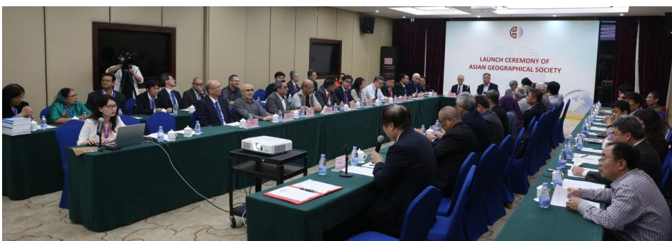
Figure 3 The 1 st business meeting of the Asian Geographical Association (AGA)