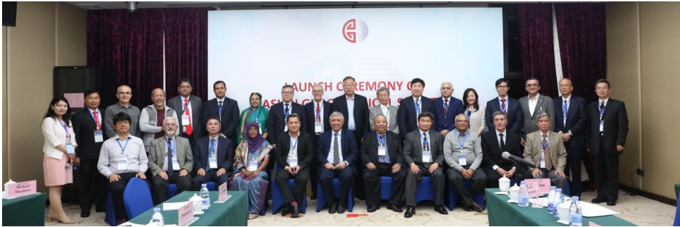
Figure 2 Group photo of founding members of the Asian Geographical Association