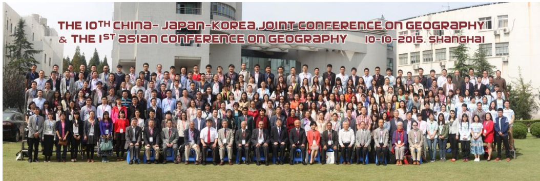
Figure 5 The 10 th China-Japan-Korea Joint Conference on Geography & the 1 st Asian Conference on Geography were held in East China Normal University in Shanghai, China during October 9–12, 2015

The 11 th Japan-Korea-China Joint Conference on Geography & the 2 nd Asian Conference on Geography were held in Sapporo, Japan in September, 2016 (Figure 6) [18] . The theme of the conference was “Frontiers of Asian Geography: Talking the Decade, Creating our Future with Young Spirits”, aiming at discussing from a geographical perspective a wide range of challenges that have arisen following economic and social developments in Asia in recent years, and to share new challenges in the development of Asian countries in the future and in future collaboration. The conference attracted more than 170 participants from four countries [18] .