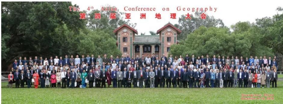
Figure 9 The Group Photo of the 4 th Asian Conference on Geography Held during December 6–10, 2018 in Guangzhou, China

The 4 th Asian Conference on Geography was held during December 6–10, 2018 in Guangzhou, China, supported by the Geographical Society of China and Sun Yat-sen University focused on “Rising Asia and Our Geography (Figures 29–30). Over 500 participants from 27 countries worldwide, including 21 countries from Asia joined the conference.