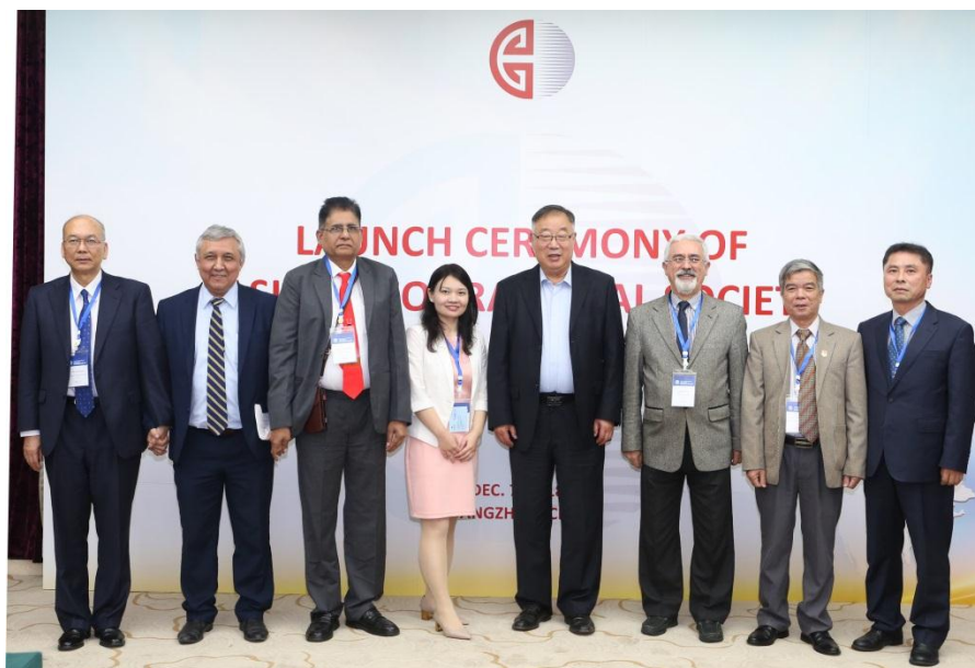
Figure 4 Group photo of the Interim Committee of the AGA