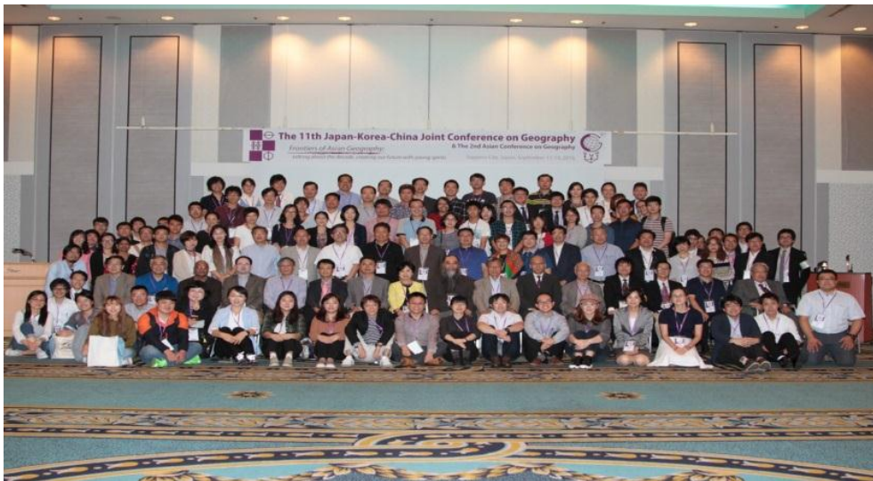
Figure 6 The 11 th Japan-Korea-China Joint Conference on Geography & the 2 nd Asian Conference on Geography were held in Sapporo, Japan in September, 2016

The 11 th Japan-Korea-China Joint Conference on Geography & the 2 nd Asian Conference on Geography were held in Sapporo, Japan in September, 2016 (Figure 6) [18] . The theme of the conference was “Frontiers of Asian Geography: Talking the Decade, Creating our Future with Young Spirits”, aiming at discussing from a geographical perspective a wide range of challenges that have arisen following economic and social developments in Asia in recent years, and to share new challenges in the development of Asian countries in the future and in future collaboration. The conference attracted more than 170 participants from four countries [18] .