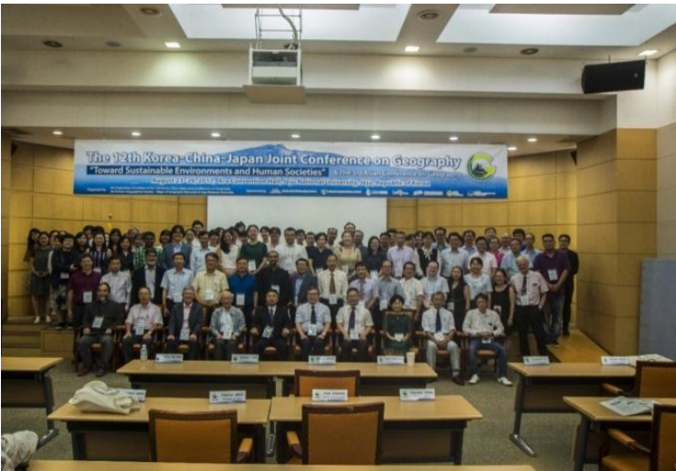
Figure 7 The 12 th Korea-China-Japan Joint Conference on Geography & the 3 rd Asian Conference on Geography were held at Jeju National University in Jeju, Korea in August 2017