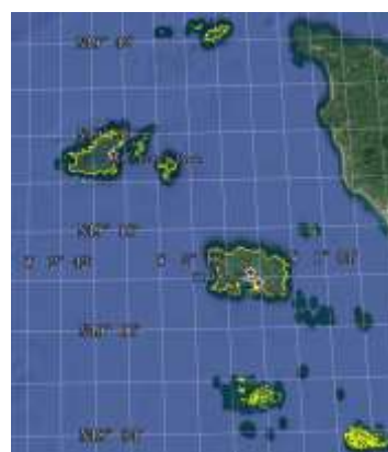
Figure 2 Map of Channel Islands (.kmz format)

Channel Islands comprise four main islands, Jersey, Guernsey, Alderney, and Sark [4] . They are 730 islands, islets, rocks and reefs with area bigger than 70 m 2 . The Jersey is the largest island, about 20 km west of the Cotentin peninsula and about 30 km south of the Guernsey. Its area is 121.63 km 2 and coastline length is 100.25 km. Around it are two uninhabited isles, one of which is Minquiers southern extremity of the Channel Islands, and the