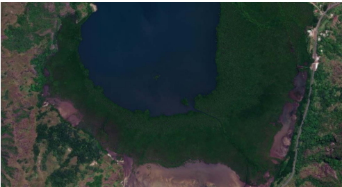
Figure 4 Image of mangrove coastal in the estuary of the north bank of Vanua Island