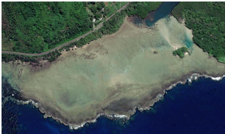
Figure 3 Image of coral reef near Savusavu on the south bank of Vanua Island (Google Earth)