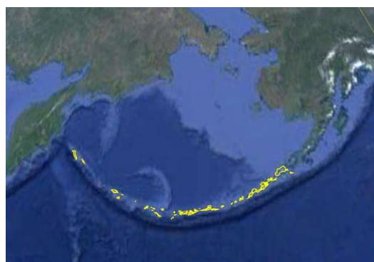
Figure 1 Dataset of Aleutian Islands in .kmz format

The Aleutian Islands extends latitude from 51°12'35"N to 55°22'14"N and longitude about 32 degrees from 165°45'10"E to 162°21'10"W, it is a chain volcanic islands belonging to both the United States and Russia [1-3] (Figure 1, 2). The islands are formed in the northern part of the Pacific Ring of Fire. They form part of the Aleutian Arc in the Northern Pacific Ocean, extending about 1,900 km westward from the Alaska Peninsula toward the Kamchatka Peninsula in Russia, and mark a dividing line between the Bering Sea to the north and the Pacific Ocean to the south. The islands comprise 6 groups of islands (east to west): the Fox Islands [4-5] , islands of Four Mountains [6-7] , Andreanof Islands [8-9] , Rat Islands [10-11] , Near Islands [12-13] and Kommandor Islands [14-15] . The first 5 islands belong to the United States, and the extreme western end, the small, geologically related Kommandor