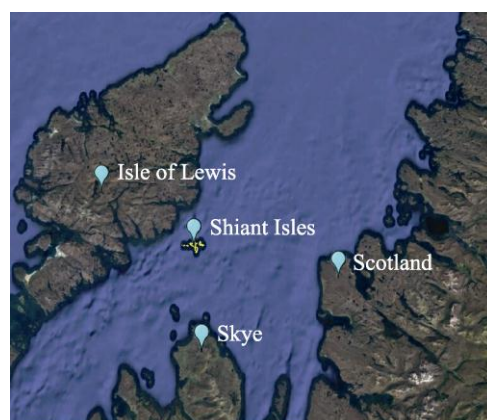
Figure 1 Geo-location of Shiant Isles (.kmz format)

The Shiant Isles consist of 3 main islands, and 18 small isles and rocks. The main islands are Garbh Eilean [5] , Eilean an Taighe [6] , and Eilean Mhuire [7] . The small islands and rocks includes Galca Mor, Galta Beag, Sgeir Mhic a'Ghobha, Sgeir Mianais, Bodach, Sgeir na Ruideag, Stacan Laidir, and Damhag, etc. [8-9] (Table 1). The total area of the Shiant Isles is 2.15 km 2 and the coastline is 17.98 km. In the Shiant Isles, Garbh Eilean is the biggest isle with an area of 0.98 km 2 , Eilean an Taighe is the second biggest one with an area of 0.66 km 2 , and Eilean Mhuire is the third one with an area of 0.42 km 2 . The dataset was developed based on the ArcGIS platform [10] , Google Earth